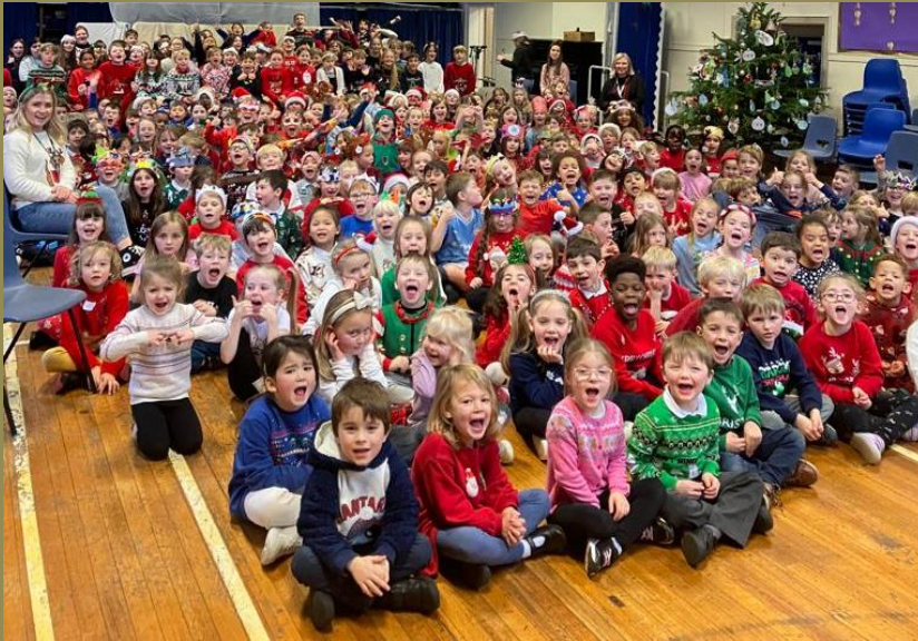
Our wonderful children on Christmas jumper day.