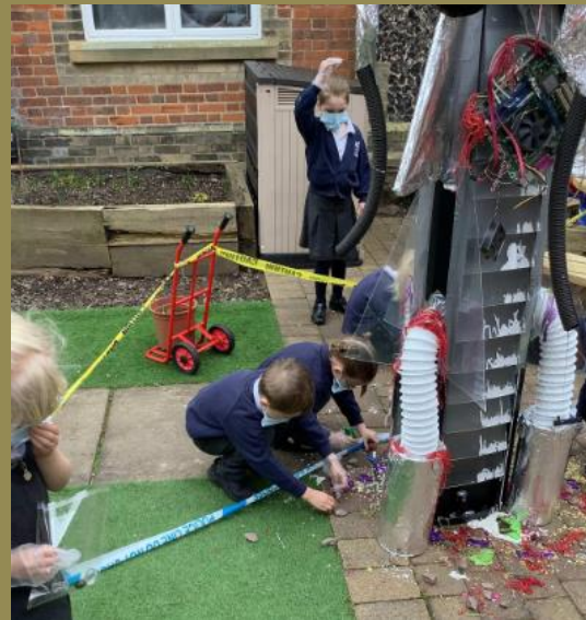
A mysterious spaceship that had crashed landed on the school grounds!