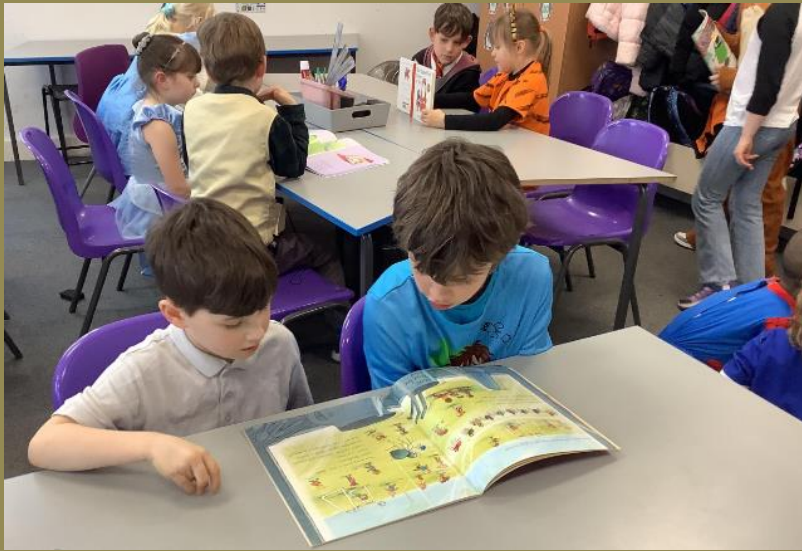
Year 5 sharing books with Year 2 children, lovely to see