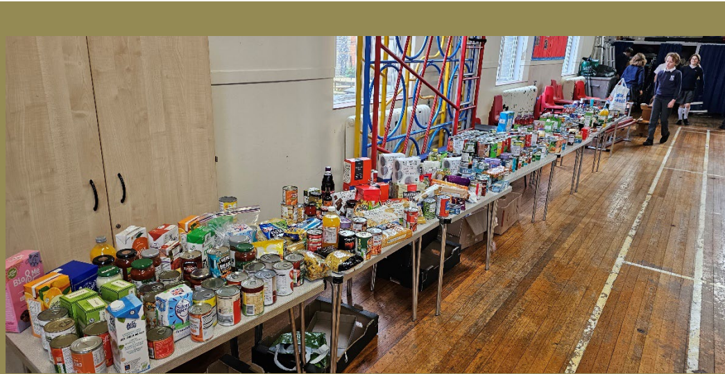
Our Harvest collection. Thank you for your generosity.